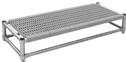
LIFESTOR® dunnage rack