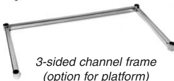
3-sided channel frame (option for platform)