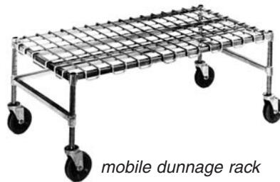
mobile dunnage rack